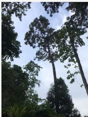
The Datali Langkawi