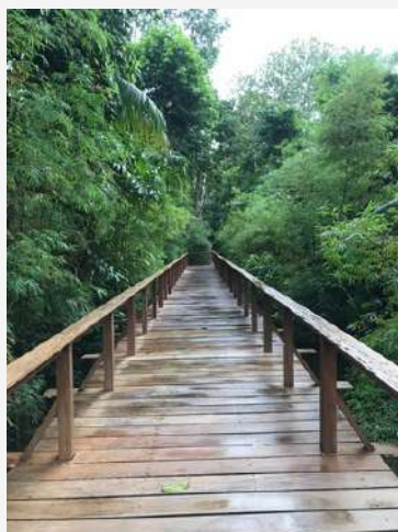
The Datali Langkawi