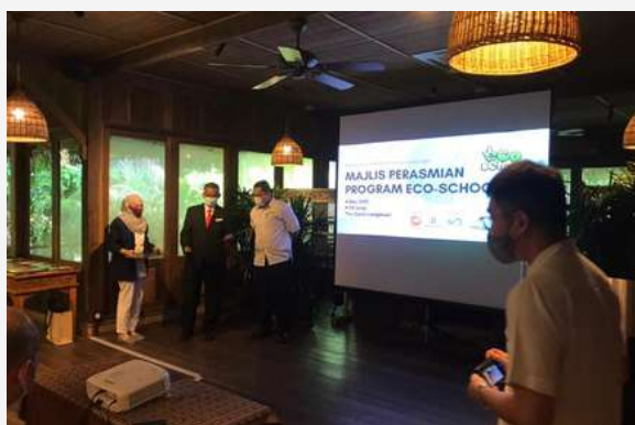
The Gulai House