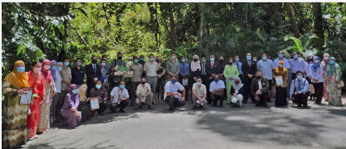
Group Photo, near The Culai House