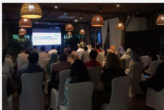
The Gulai House