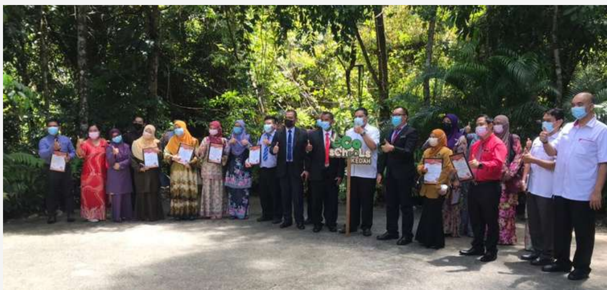
Group Photo, near The Gulai House