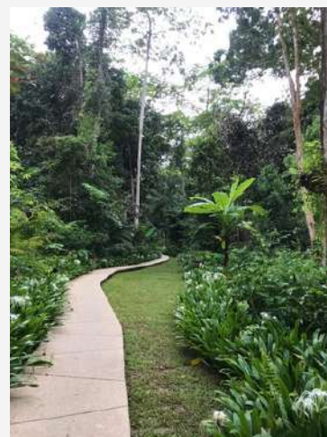
The Datali Langkawi